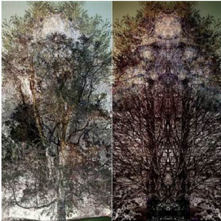
Untitled from the Common Ground Collection Alexander Sutulov - Chile

The Global Environmental Institute, established in Beijing, China in 2004, is a Chinese non-profit, non-governmental organization. Its mission is to design and implement market-based models for solving environmental problems in China in order to achieve development that is economically, ecologically, and socially sustainable. http://www.geichina.org/